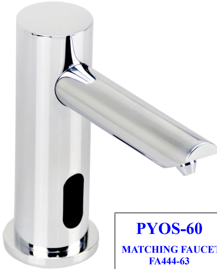
PYOS-60 MATCHING FAUCET FA444-63

Package Includes Spout Soap Pump All Hose Connections between Pump and Spout 800ml Soap Bottle Battery Case and Case Holder Mounting Hardware Remote Control Optional All hardware necessary for satisfactory installation